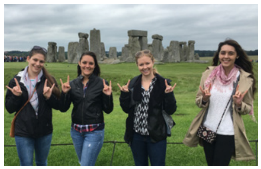
USF Bulls at Stonehenge, England.