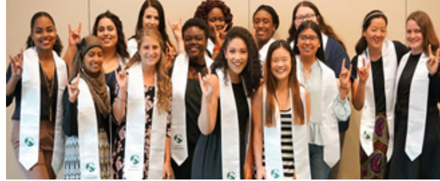
USF's GloBull Ambassadors.