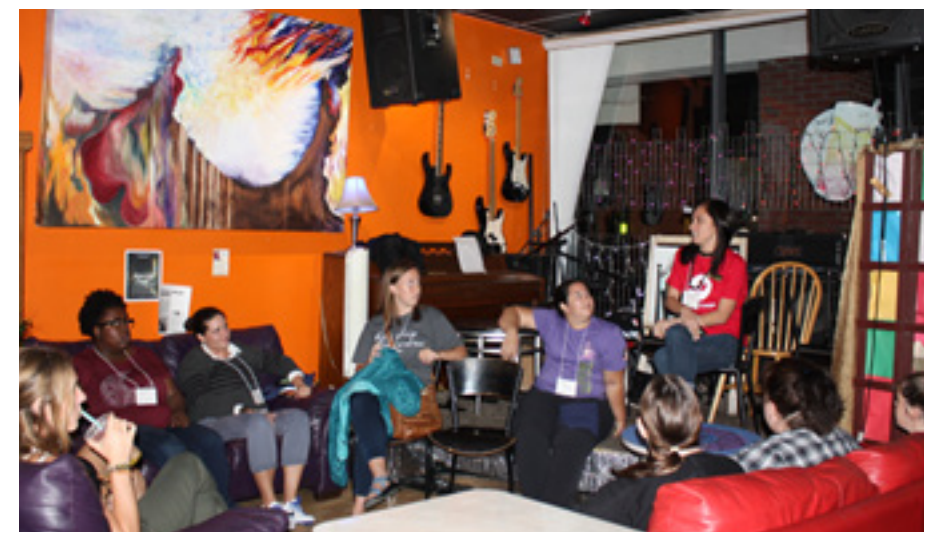
USF's Peace Corps Ambassadors at The Boba House for a Story Slam.

Peace Corps and the University of South Florida have a partnership centered on an undergraduate program called Peace Corps Prep (PC Prep). Students who join the PC Prep program will combine targeted coursework with hands-on experience, building the competencies needed to be strong Peace Corps volunteers or other international development specialists.