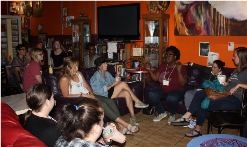
USF's Peace Corps Ambassadors at The Boba House for a Story Slam.

Peace Corps and the University of South Florida have a partnership centered on an undergraduate program called Peace Corps Prep (PC Prep). Students who join the PC Prep program will combine targeted coursework with hands-on experience, building the competencies needed to be strong Peace Corps volunteers or other international development specialists.