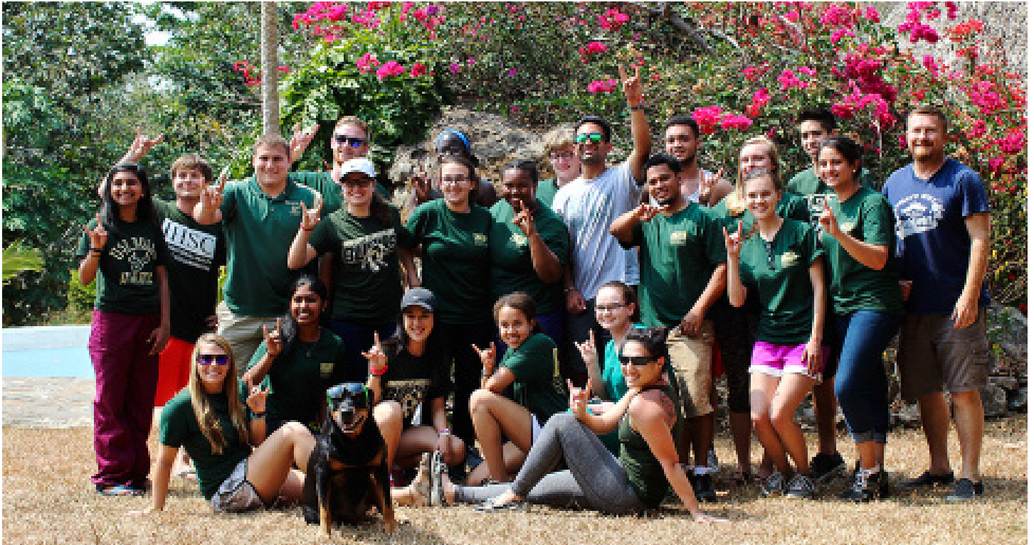
USF Education Abroad Receives IIE Andrew Heiskell Award for Access and Equity! USF Bulls in Chica, Panama.