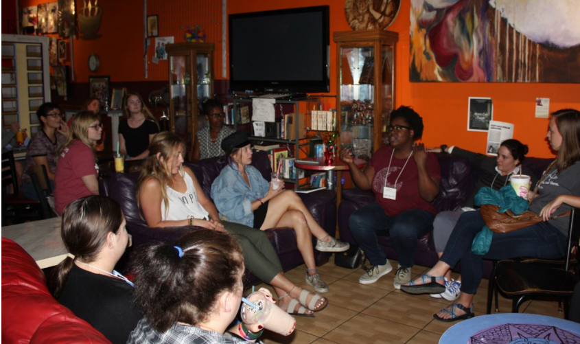
USF's Peace Corps Ambassadors at The Boba House for a Story Slam.

Peace Corps and the University of South Florida have a partnership centered on an undergraduate program called Peace Corps Prep (PC Prep). Students who join the PC Prep program will combine targeted coursework with hands-on experience, building the competencies needed to be strong Peace Corps volunteers or other international development specialists.