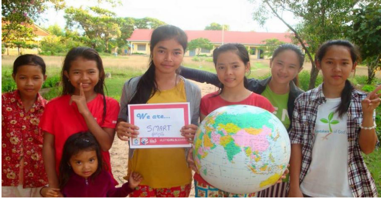
at Camp GLOW (Girls Leading Our World), Cambodia.