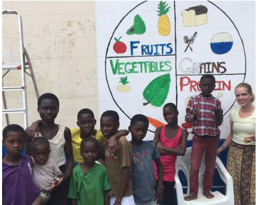
Photo Courtesy of Abigail Kaiser, current PC volunteer in Ghana, 2017.