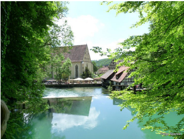
USF SUMMER IN GERMANY. 2010. JPEG.

The people you photograph may have strong religious or animist/indigenous beliefs that prohibit photographs of children or temples; women may not be allowed to be photographed; the military and police and their buildings are almost always off limits to photography; and some people simply do not want to be photographed!