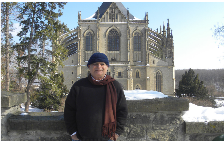
SPRING BREAK IN PRAGUE. 2010. JPEG FILE.

Possibly more importantly is learning what clothing is culturally appropriate and what is not. Here in Tampa, you have a great deal of freedom in what you can wear. In other countries, wearing shorts or shirts that show your shoulders can be highly inappropriate. Think about how you are going to be perceived when studying abroad, including your attire and your actions, language, gestures, etc. There’s no easy “one size fits all” guide of how to dress and act appropriately. Some may take what may be a typical behavior to you as inappropriate, depending on the situation.