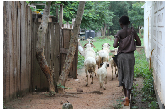
AFRICA. 2011. JPEG.

In 1994 congress passed the Violence Against Women Act (VAWA) . This act is in recognition of the severity of the crimes associated with domestic violence, sexual assault and stalking . The protections and provisions afforded victims of such crimes were expanded and designed to improve criminal justice responses to domestic violence and increase the availability of services to those victims. Among other things, victims are now also afforded the right to sue the offender as well as the university if Title IX or VAWA is not followed. You can read more about the History of VAWA by following this link (Links to an external site.).