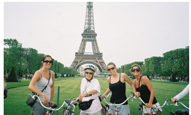
USF LONDON AND PARIS PROGRAM. 2010. JPEG.

RULE #1: THERE IS NO SUCH THING AS A “SAFE” DESTINATION. There was a time when many international travelers felt completely safe going to France or Denmark. Those days are long gone. A quick review of current events from 2015 will quickly identify the Charlie Hebdo attack in France and the Copenhagen terror shootings.