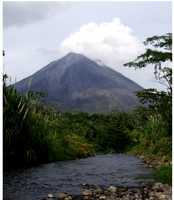
COSTA RICA. 2011. JPEG.

Another place to find relevant information is at the international travel sections of bookstores. Browse through or purchase one or two guidebooks, such as Let's Go , Rick Steves , Lonely Planet , Berkeley Guides , or Rough Guides . To travel light, download the mobile app version of the travel guides.