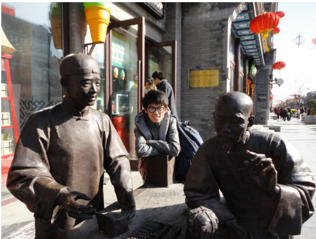
SPRING BREAK IN CHINA. 2012. JPEG.