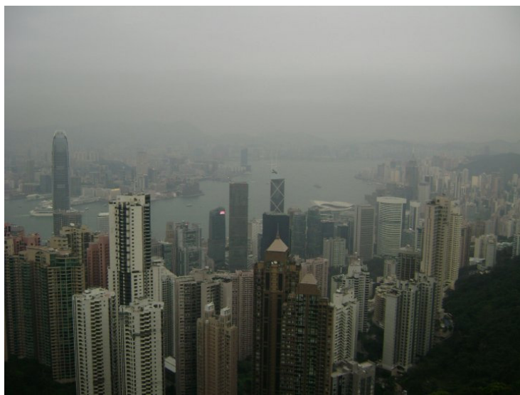
GUANGZHOU-SHENZHEN-HONG KONG EXPRESS RAIL LINK. CHINA. 2011.

First, do not purchase your airline tickets until you are told to do so by your Education Abroad Advisor or your Program Leader. If you purchase your tickets too early and the program is changed or cancelled, you will be responsible for the cost of your tickets. Group ticket purchases are often handled by the Education Abroad Office though you may also be responsible to purchase your own ticket. When flying as a part of a group , you must follow the flight itinerary as planned for the group. If you wish to travel outside the group schedule, you will be financially responsible for those additional travel costs.