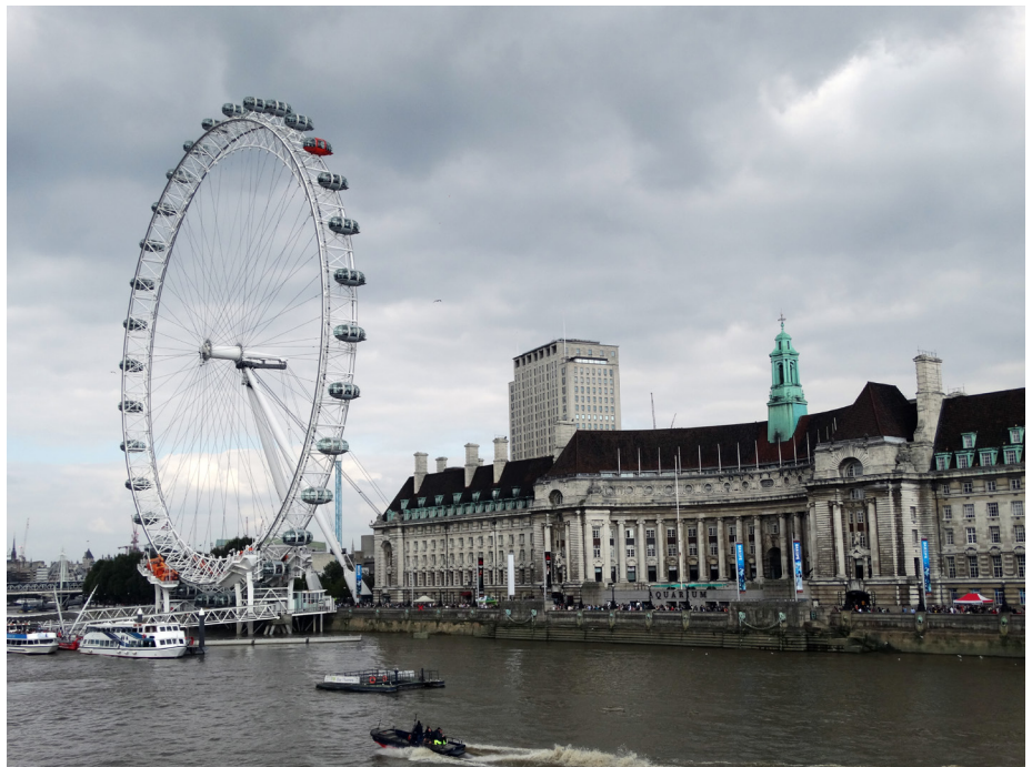
SUMMERLAB: ARCHITECTURE IN LONDON. 2014. JPEG.

Chip-and-PIN credit cards are credit cards with a built-in chip for added security. Instead of the traditional credit cards that are swiped, the card is inserted into the chip reader and the card's owner inputs a PIN to complete the transaction. While the roll out of this technology is slowly coming into use in North America, it is already widespread in Western Europe, especially in the United Kingdom. While most vendors still have a credit card “swipe” option, travelers should be prepared to use alternative payment methods should the traditional method not be available. You may pre-purchase a chip-and-PIN credit card from companies like Travelex ( www.travelex.com ) with funds pre-loaded on the card if you so desire. Inquire with your credit card company as to the availability of this technology with your existing cards.