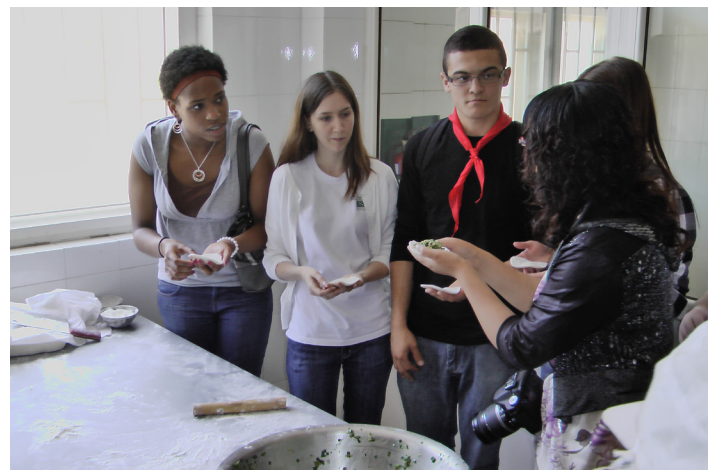
USF CHINESE LEARNING IN THE CULTURE PROGRAM -- TIER II. 2010. JPEG.

Regardless of the type of international experience you will be on while a student at USF, we hope to make it abundantly clear that the activities you engage in must be of the low risk variety. We understand there will be many tempting adventurous activities offered to you, but if any of those activities could cut your experience short, you need to avoid them at all costs. You have invested a great deal of time and money, so we want you to make the most of it. There will be many opportunities for fun, and we certainly want you to have a great time. Just do so responsibly by following our guidance in this section.