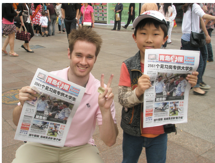
USF CHINESE LEARNING IN THE CULTURE PROGRAM -- TIER II. 2010. JPEG.

Please keep in mind that your travel on a USF activity is not designed to provide you with adventurous experiences. Adventure tourism is not our bag. The reason is simple. You are investing a lot of money and time into this experience to advance your educational career. Any one of the activities discussed below can lead to an injury or even death, ending your experience for good. Keep the “STUDY” in international study-abroad.