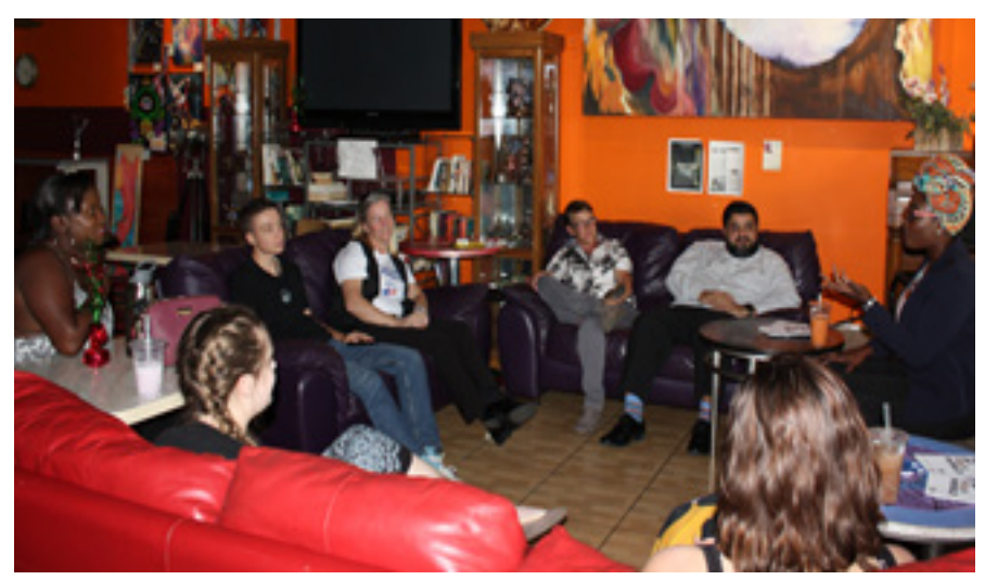
USF's Peace Corps Ambassadors at The Boba House for a Story Slam.

Peace Corps and the University of South Florida announced a new partnership centered on an undergraduate program called Peace Corps Prep. Students who join the Peace Corps Prep program will combine targeted coursework with hands-on experience, building the competencies needed to be strong Peace Corps volunteers or other international development specialists.